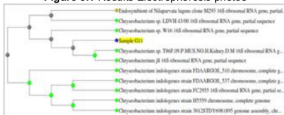
Figure 5.1 Results Electrophoresis photos

In 16SrRNA gene sequencing results on isolates G1.1, BLAST done online through https://www.ncbi.nlm.nih.gov/nucleotide/JX287899.1,AY278484.2,KC853182.1,CP033828.1,JQ9758.1,AY468476.1,LR215967.1,CP033930.1,CP033760.1,MH628236.1 , BLAST results found so that has indent of 99% and coverage of 100% on the sample that is Chryseobacterium sp G1.1 with accession number JX287899.1, Chryseobacterium sp. JLL with accession number AY278484.2, Chryseobacterium sp. W16 with accession number KC853182.1, Chryseobacterium indologenes with accession number CP033828.1, Endosymbiont of Nilaparvata lugens with accession number JQ975885.1, Chryseobacterium sp. LDVH 43/00 with accession number AY468476.1, Chryseobacterium indologenes with accession number LR215967.1, Chryseobacterium indologenes with accession number CP033930.1, Chryseobacterium indologenes with accession number CP033760.1, Chryseobacterium indologenes with accession number MH628236.1. to the results of BLAST 5.2 can be seen in the figure below: