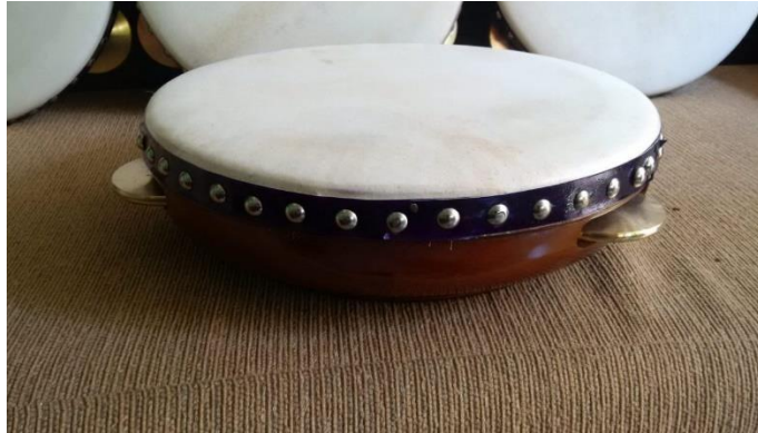
Figure 4. Tambourine, one of the musical instruments of Cakalele Banda

Figure 4 shows that the acculturation of Asian and Middle Eastern culture is very strong in the cakalele banda dance. The tambourine is a traditional musical instrument that originated in various regions of the world, especially in Asia and the Middle East. (Doubleday, 1999; Rakhimova et al., 2023). Although there are variations in form and use, the Rebana generally consists of a drum made of leather stretched over a wooden or metal frame. The tambourine has specific characteristics in each region and is used in different cultural and religious contexts. In addition, European cultural influences can also be found in some aspects of Cakalele Banda. For example, in Cakalele Banda performances, European musical instruments, such as drums or trumpets (Bowles, 2017), may be adapted into the context of local traditions. Also, in terms of costumes, there may be elements inspired by European clothing styles or the use of materials imported from Europe.