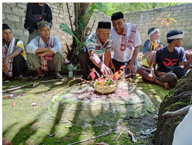
The process of tahlilan and pilgrimage

The prayers aim to ask for safety on the journey and return from the pilgrimage, and there is no shortage of anything. The men, young and old, from the three administrative lands included in the Namasawar petuanan, which numbered approximately 30 people, were ready to participate in the pilgrimage. The pilgrims were divided into three groups, namely groups 1 and 2 of the land route and 3 of the sea route. The first group was led by an Orlima who was in charge of the grave pilgrimage with the destinations of; Rumah Adat, Mesang Jadi, Gunung Manangis, Gunung Tujuh, Batu Lanang, Parigi Laci; this group was then called the "Gunung tujuh" group. The Orlima Kepala and an Imam lead the second group for a pilgrimage to five tombs, namely; Rumah Adat, Kebun Kelapa, Papan Berek, Boy Kerang, Kubor Gila, Kota Banda, Batu Masjid, and Parigi Laci. An Orlima leads the third group and gets a route by sea: Rumah Adat, Gunung Api, and Parigi Laci.