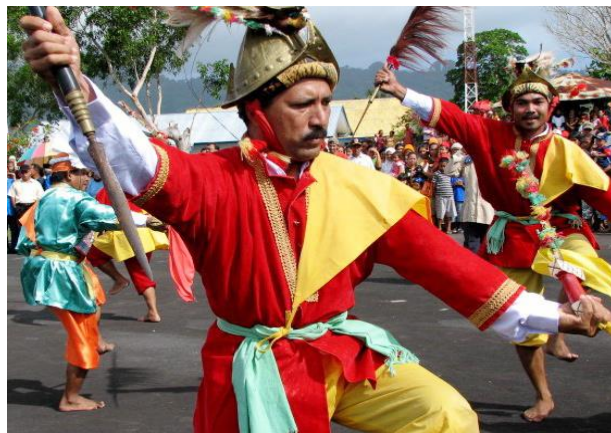
Figure 5. Banda Cakalele Dance Movement

The following cultural acculturation is in the cakalele banda dance movement; here is Figure 5 display of the cakalele banda movement.