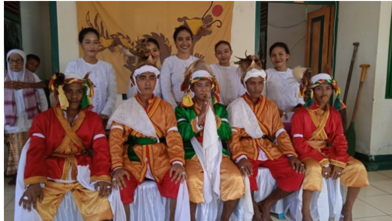
Figure 2. Banda Cakalele dancers

Figure 2 shows that the Cakalele Banda traditional dress reflects Asian cultural acculturation in various design aspects and elements. This can be seen in the following examples. Chinese influence: In some Cakalele Banda costumes, the influence of traditional Chinese clothing is visible, especially in the form of high collars and intricate embroidery decorations. This suggests a cultural exchange between the Banda people and Chinese traders or colonizers in the past (Lape, 2000). As for the motifs and patterns of Banda's Cakalele traditional dress, there are motifs and patterns inspired by traditional Asian art and design. For example, there is the use of dragon, phoenix, or lotus flower motifs, common in traditional Asian art and fabrics (Williams, 2006); Cakalele Banda's use of colors and fabrics can also show the influence of Asian culture. Some outfits use bright colors such as red, gold, or green, often associated with luck and strength in Asian cultures (Palmer et al., 2012). In addition, the use of silk fabrics or fabrics that have an Asian smoothness and luster can also be found in some costumes; the accessories used in Cakalele Banda traditional clothing can also reflect Asian cultural acculturation, including jewelry such as bracelets or necklaces that have designs and motifs similar to traditional Asian jewelry such as beads or jade (Nguyen, 2008).