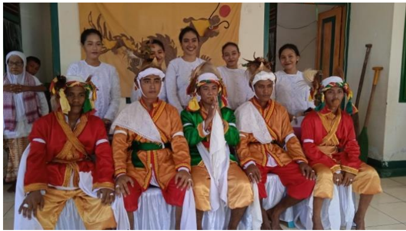
Figure 2. Banda Cakalele dancers

Figure 2 shows that the Cakalele Banda traditional dress reflects Asian cultural acculturation in various design aspects and elements. This can be seen in the following examples. Chinese influence: In some Cakalele Banda costumes, the influence of traditional Chinese clothing is visible, especially in the form of high collars and intricate embroidery decorations. This suggests a cultural exchange between the Banda people and Chinese traders or colonizers in the past (Lape, 2000). As for the motifs and patterns of Banda's Cakalele traditional dress, there are motifs and patterns inspired by traditional Asian art and design. For example, there is the use of dragon, phoenix, or lotus flower motifs, common in traditional Asian art and fabrics (Williams, 2006); Cakalele Banda's use of colors and fabrics can also show the influence of Asian culture. Some outfits use bright colors such as red, gold, or green, often associated with luck and strength in Asian cultures (Palmer et al., 2012). In addition, the use of silk fabrics or fabrics that have an Asian smoothness and luster can also be found in some costumes; the accessories used in Cakalele Banda traditional clothing can also reflect Asian cultural acculturation, including jewelry such as bracelets or necklaces that have designs and motifs similar to traditional Asian jewelry such as beads or jade (Nguyen, 2008).