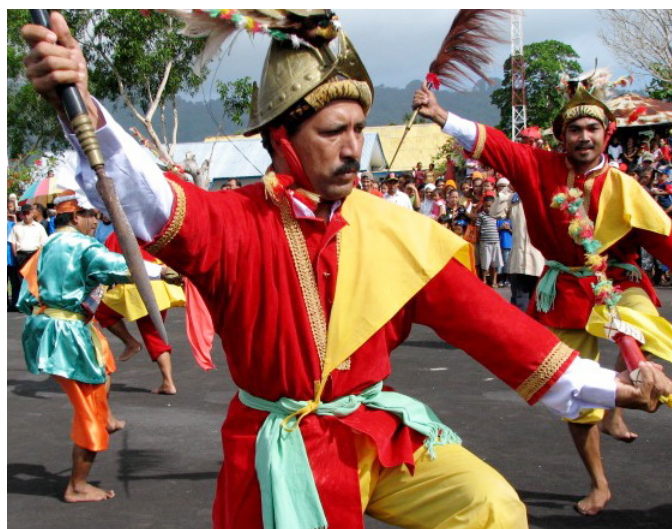
Figure 5. Banda Cakalele Dance Movement

The following cultural acculturation is in the cakalele banda dance movement; here is Figure 5 display of the cakalele banda movement.