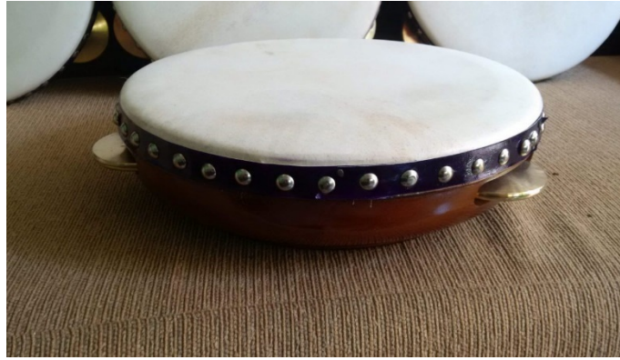
Figure 4. Tambourine, one of the musical instruments of Cakalele Banda

Figure 4 shows that the acculturation of Asian and Middle Eastern culture is very strong in the cakelele banda dance. The tambourine is a traditional musical instrument that originated in various regions of the world, especially in Asia and the Middle East. (Doubleday, 1999; Rakhimova et al., 2023). Although there are variations in form and use, the Rebana generally consists of a drum made of leather stretched over a wooden or metal frame. The tambourine has specific characteristics in each region and is used in different cultural and religious contexts. In addition, European cultural influences can also be found in some aspects of Cakalele Banda. For example, in Cakalele Banda performances, European musical instruments, such as drums or trumpets (Bowles, 2017), may be adapted into the context of local traditions. Also, in terms of costumes, there may be elements inspired by European clothing styles or the use of materials imported from Europe.