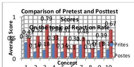
Figure 2. Comparison of mean pretest and posttest scores for each concept on the topic of reaction rate

Constraints faced in implementing P2BMT To be able to identify the constraints faced in implementing P2BMT, researchers examine the results of field notes and recordings from tape recorders and digital cameras. Obstacles observed can be categorized into two types, namely related constraints with learning tools and constraints related to the learning process.